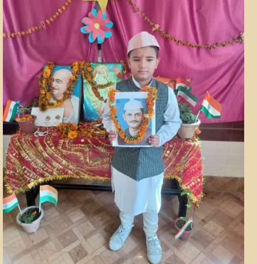
Cleanliness program conducted on 01 october, to mark Gandhi lavanti